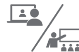
Online + Classroom